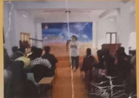
Softskill Development Workshop